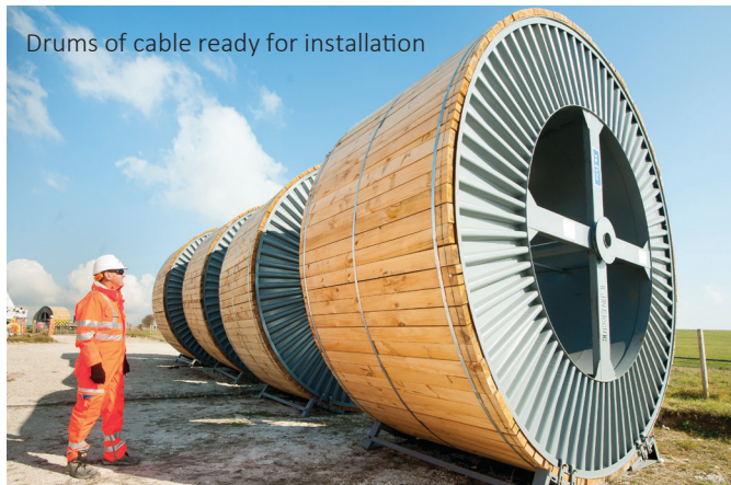
Drums of cable ready for installation

Since our previous newsletter was published in October last year, work on the construction of the onshore cable has slowed in line with the winter season. As anticipated, conditions over this period have been wet and cold, leading to a shift in some activity from on-site to indoors with planning and scheduling for the coming milder weather.