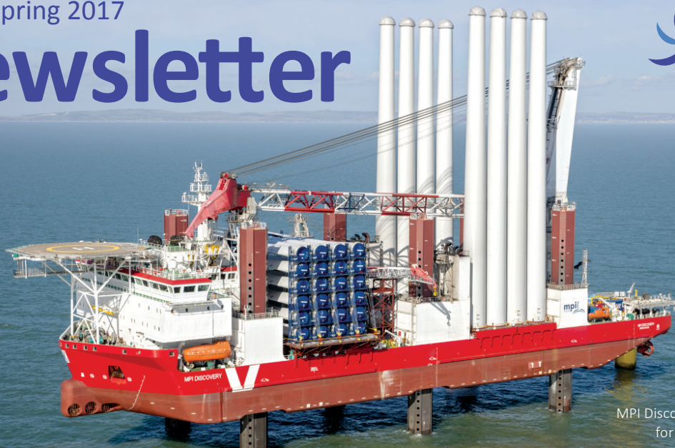
MPI Discovery at the Rampion site with components for eight full turbines onboard

South coast residents and visitors may have already seen the significant milestone that we announce in this seventh edition of our newsletter, the installation of the first wind turbine.