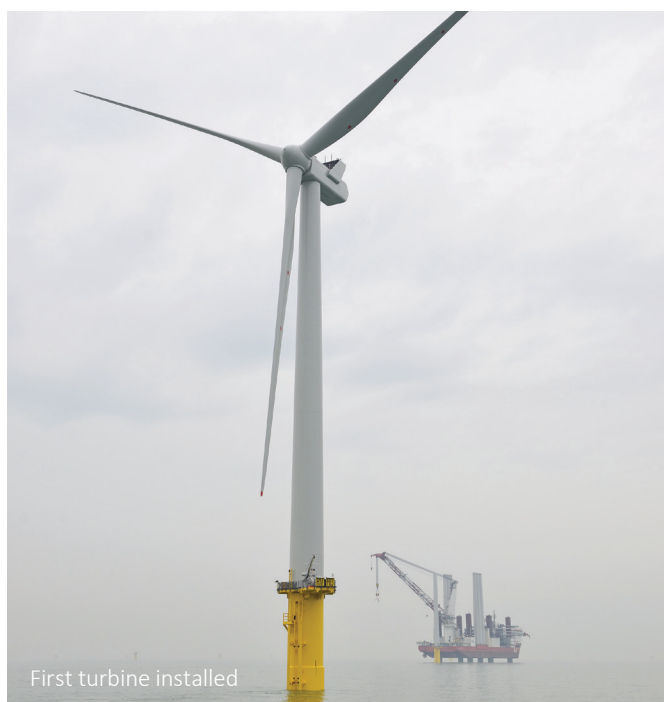
First turbine installed