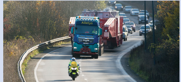
A police escort along the A23 for one of two transformers heading to the Rampion substation

The transformers, each weighing 210 tonnes and measuring almost 10 metres long and 4.4 metres high, are an integral component of the substation, which is now really taking shape.