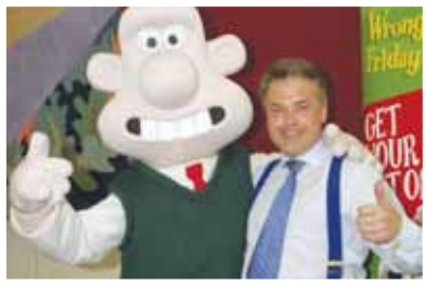
An MP's job is never dull